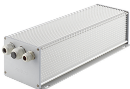
GearUnits - MASTER MHN-SA - 2000 W