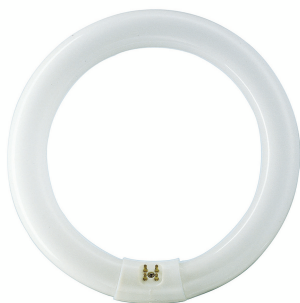
G10q C-T9 29 mm