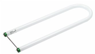
Medium Bi-Pin Fluorescent U-bent T 8/8 inch with 6" spacing