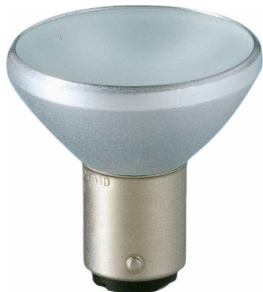
B15/BA15d R37 Frosted