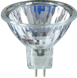
GU5.3, MR16, Open