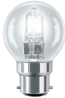
B22, P45, Clear