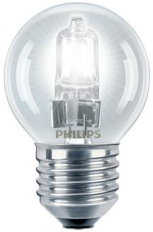
E27, P45, Clear