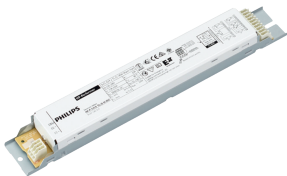
Lamp Driver, eFluo, HF-P 3/418 TL-D III 220-240V 50/60Hz IDC