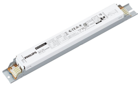
Lamp Driver, eFluo, HF-P 136 TL-D III 220-240V 50/60Hz IDC