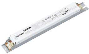
Lamp Driver, eFluo, HF-P 158 TL-D III 220-240V 50/60Hz IDC