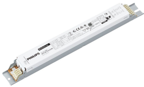
Lamp Driver, eFluo, HF-P 236 TL-D III 220-240V 50/60Hz IDC