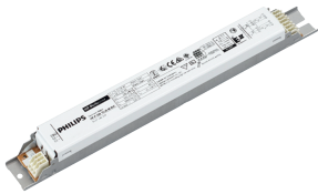
Lamp Driver, eFluo, HF-P 258 TL-D III 220-240V 50/60Hz IDC