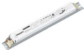
Lamp Driver, eFluo, HF-P 236 TL-D III 220-240V 50/60Hz IDC