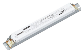
Lamp Driver, eFluo, HF-P 158 TL-D III 220-240V 50/60Hz IDC