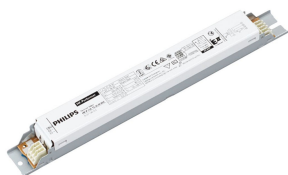
Lamp Driver, eFluo, HF-P 136 TL-D III 220-240V 50/60Hz IDC