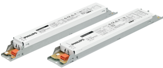
HF-S 118, 136 & 158 TL-D II, HF-S 3/414, 3/424 TL5 II