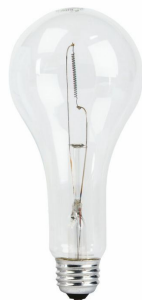
E26, PS25, Clear