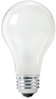
E26, A19, Frosted