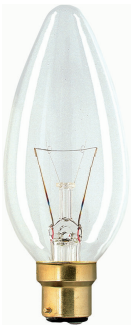
LPPR ICANBSTD B22 B35 CL