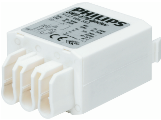
GPPR SKD 0001