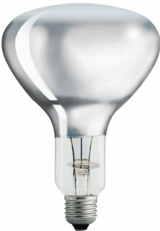
LPPR IRSG E27 R125 Clear