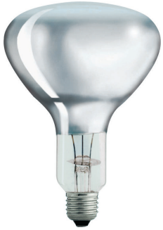
E27, R125, Clear