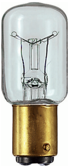
LPPR ITUBAPE 0001