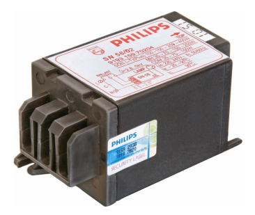
GPPR INIGNO1 0001