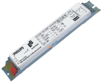
AXL EBP 154