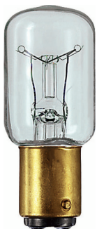
LPPR ITUBAPE 0001