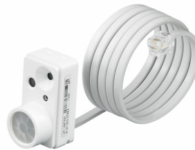
LR11663/00 ActiLume gen2 Multi-Sensor