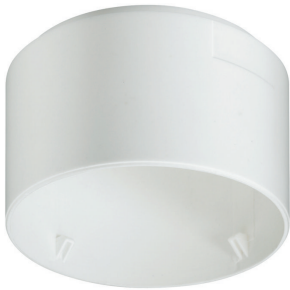
LRH2070/00 SURFACE BOX