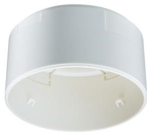
LRH1070/00 SENS R SURFACE BOX