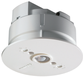
LRM1070/00 SENS R MOV DET ST