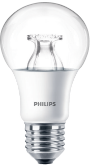
LEDbulb MAS SLR1 A60 E27 CL 1