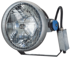
MVF403 - MASTER MHN-LA - 1000 W