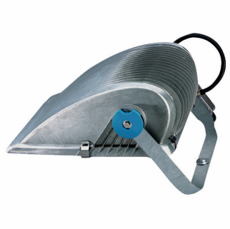
Optivision Conventional Floodlight