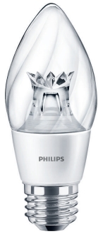
E26 F15 CL