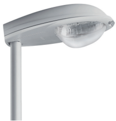
Iridium SGS252/452 road-lighting luminaire with polycarbonate bowl (PC)