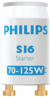
S16 70-125 W, WH