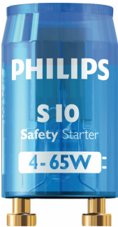
LPPR STARTER PHL 0003