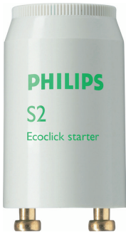
LPPR STARTER PHL 0004