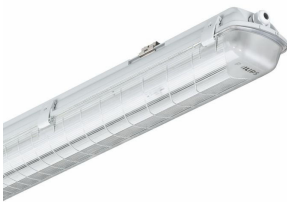
TCW060 C 2xTL5