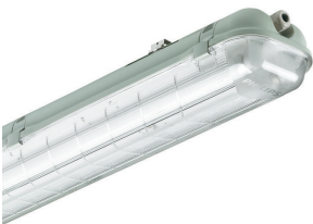
TCW060 C 2xTL