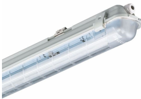
TCW060 C 1xTL5