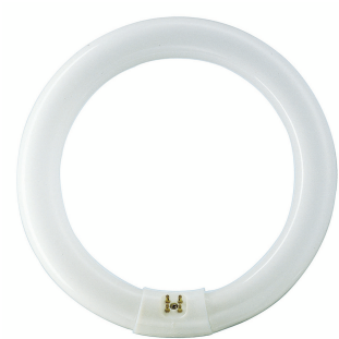
LPPR TL-ESTD G10q