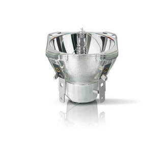
XPPR XDMSD 0010