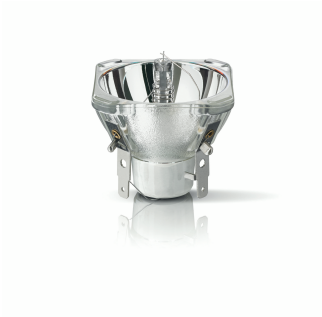
MSD Platinum 2 R