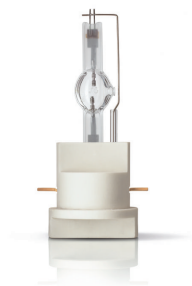
MSR Gold™ 700, 700/2, 1200 FastFit