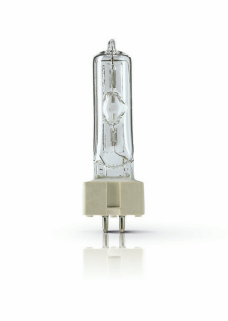
XPPR XDMSR 0025