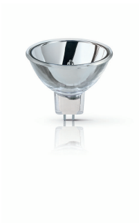
XPPR XHOPDI 0002