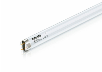
Actinic BL TL-D 15W/10 1SL/25