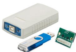
DTK622 Network Gateway