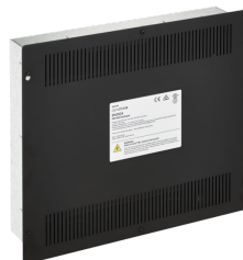
DH2x24, DIN Rail Enclosure