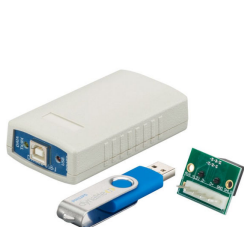
DTK622 Network Gateway