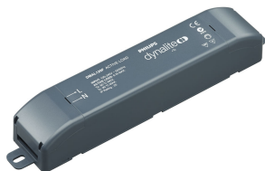
DMAL120F Active Load