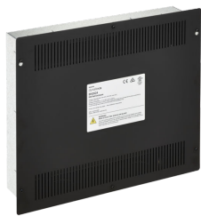
DH2x24, DIN Rail Enclosure