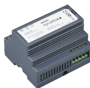
DDNP1501 Product shot