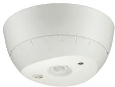
DUS360CS(-DALI) Surface mount 360° ceiling sensor