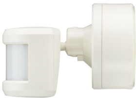
DUS90CS and DUS30CS wall mounted