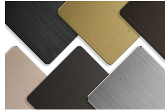
AntumbraButton - Different colors Button Finish