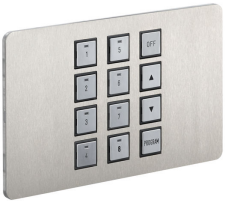
DPNE-SF Classic Series Screwless fascia EU