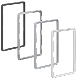
Different RIM colors EU