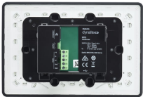
Philips Dynalite Touchscreen PDS Detail Photo Back