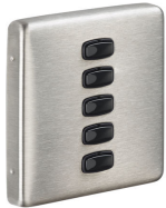
DLPE Standard Series EU