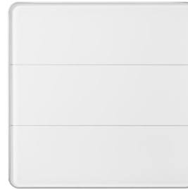
PATPE AntumbraTouch EU White - Front