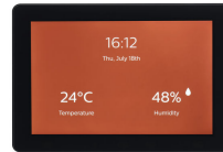
Philips Dynalite Touchscreen PDS Detail Photo Front