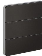
PABPE AntumbraButton EU