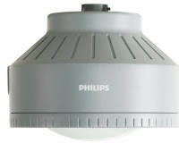
BY200P LED32 L-B