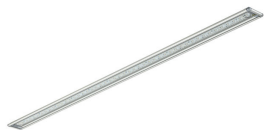
TubeLine BGP360 tunnel luminaire