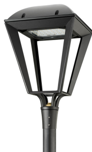
IJM-1 - LED EconomyLine 8000 lm