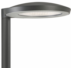
CitySoul gen2 mini BPP530 pedestrian luminaire, pole mounted version