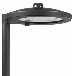
CitySoul gen2 Mini - LED module 6000 lm - 830 warm white - Power supply unit with DALI and SystemReady interface - Safety class II - Distribution medium 50 - Clear glass - Gray - Philips standard surge protection level - - - Post-top for diameter 60 mm