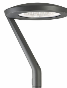
CitySoul gen2 LYRE - LED module 6000 lm - 830 warm white - Power supply unit with DALI interface - Safety class II - Distribution medium 50 - Clear glass - Gray - Luminaire surge protection level until 10 kV differential mode and 10 kV common mode - - - -