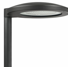
CitySoul gen2 Mini - LED module 6000 lm - 830 warm white - Power supply unit with DALI interface - Safety class II - Distribution medium 50 - Clear glass - Gray - Philips standard surge protection level - - - Post- top for diameter 60 mm