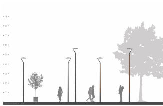
2D rendering CitySoul gen2 Bracket - Lyre