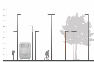
2D rendering CitySoul gen2 Bracket - Top