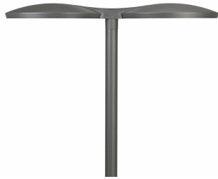
Double post-top spigot