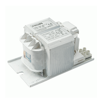
BHL 250L 200