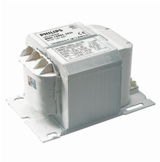
BHL 1000L 202